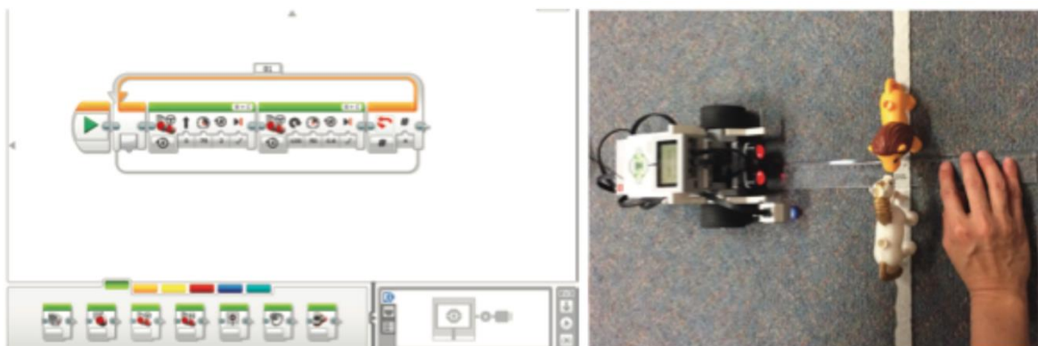
Figure 1. Ev3 Mindstorm Robotics (a) block code program, and (b) robot in action

We will limit our description to Ev3 Mindstorms Robotics (see Figure 1), which is a collaborative educational technology that uses simple visual blocks to program (Figure 1a), and technic Lego bricks with a variety of sensors that allow for construction of relatively sophisticated robots (Figure 1b) that execute programmed code (Eguchi, 2010). It is currently used in many primary and secondary schools in Australia due to its modification flexibility, ability to interact with the world using sensors, and relatively easy-to-learn visual programming with blocks. It also allows teachers to later introduce more challenging programming through using a more traditional written code.